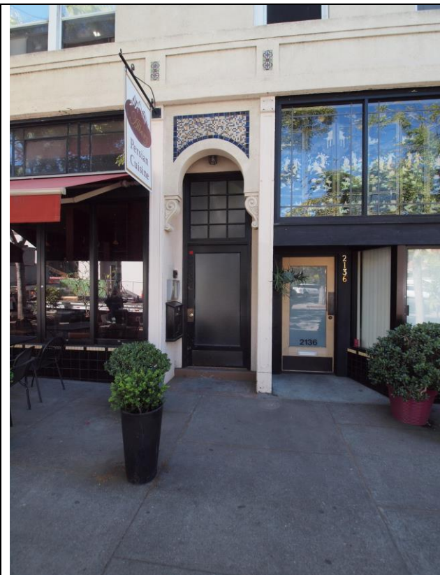
Upstairs entry from Center Street (right)