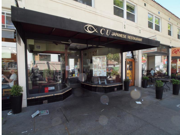
Typical storefront, viewed facing southwest.