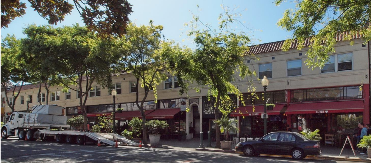
View of façade extents, facing southeast.

This commercial building is notable for its long-low façade and horizontal Mediterranean Revival materials and details. The building is divided in half horizontally between the full-height glazing and narrow posts at the storefront level and the stucco bands that span the upper façade.