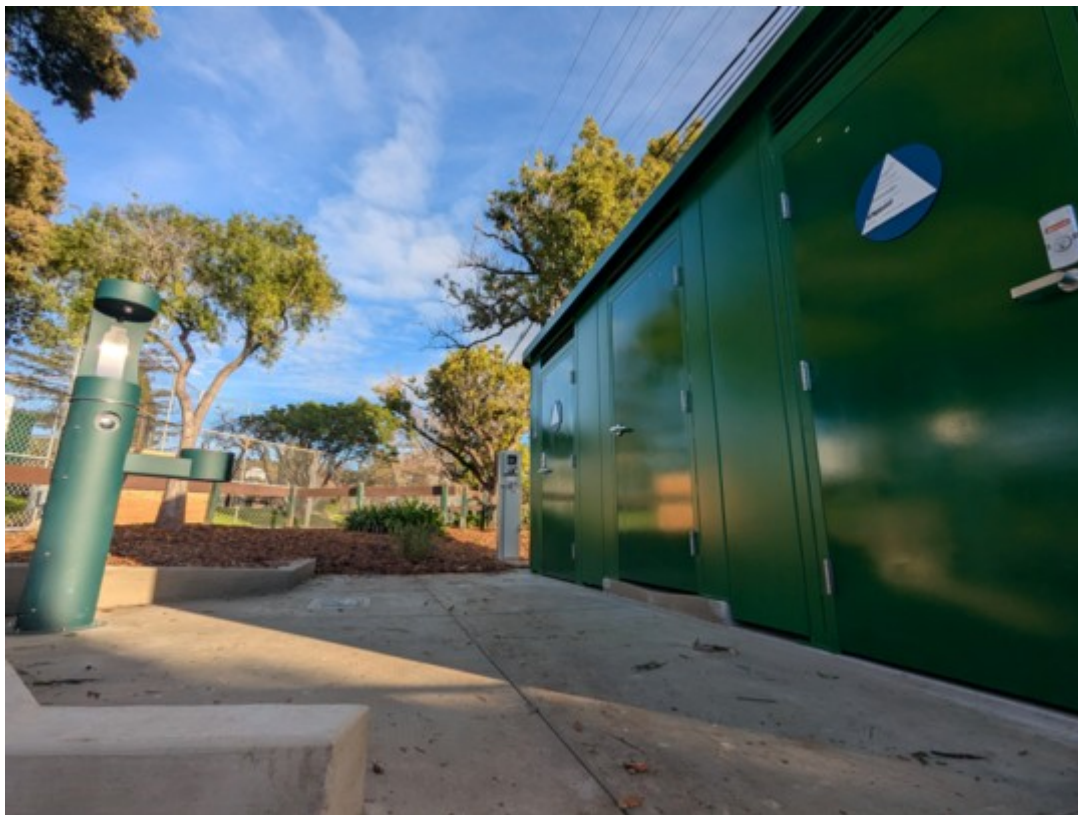
Ohlone Park New (2 stall) Restroom & drinking fountain