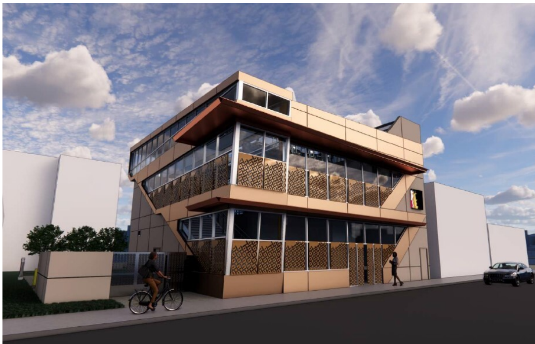
African American Holistic Resource Center Rendering

The African American Holistic Resource Center (AAHRC) will be a new community services building that will replace the existing 3,910 square foot