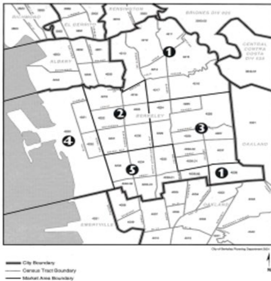
City of Berkeley Census Tract Map & Market Areas