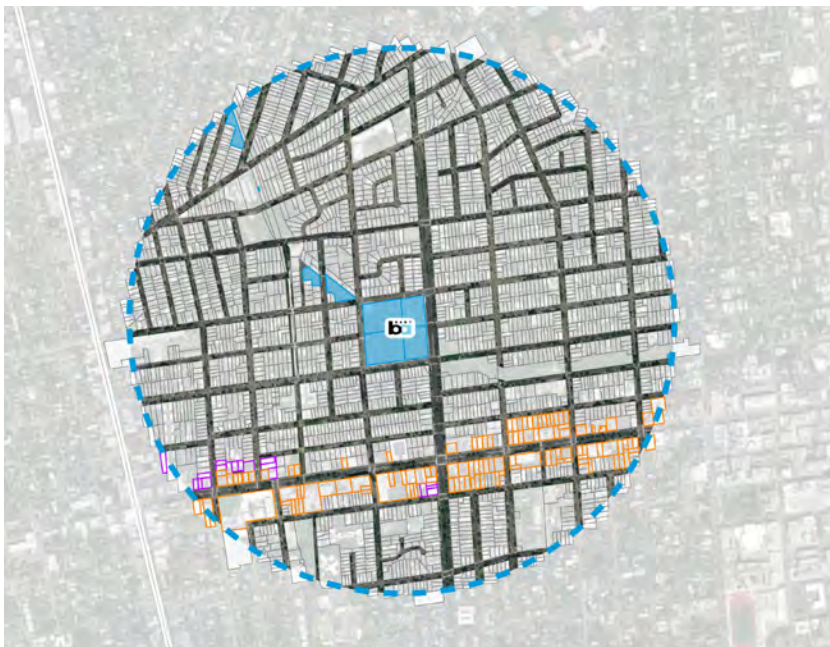
Figure 2 + Table 2: Maximum Allowable Building Height Within 0.5 mile of BART Station Entrance(s)