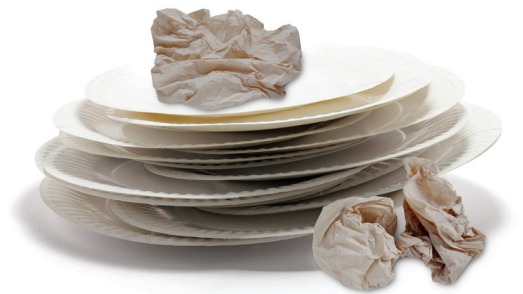
Only uncoated paper products