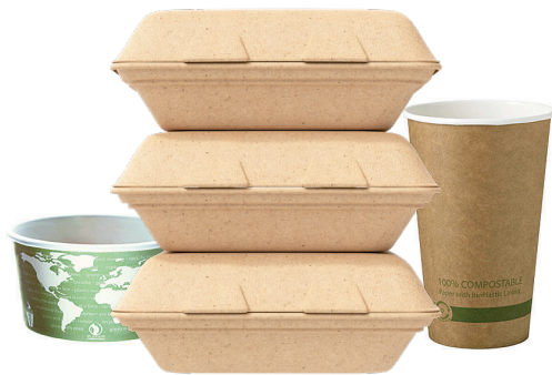
Only BPI certified compostable fiber-ware