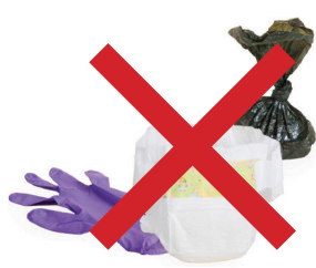
diapers pet waste