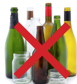
glass • liquids