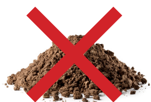
dirt, rock or concrete