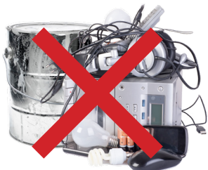
hazardous or electronic waste