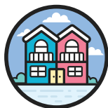
The "Golden Duplex" exemption

These units are exempt from all aspects of the Rent Ordinance.